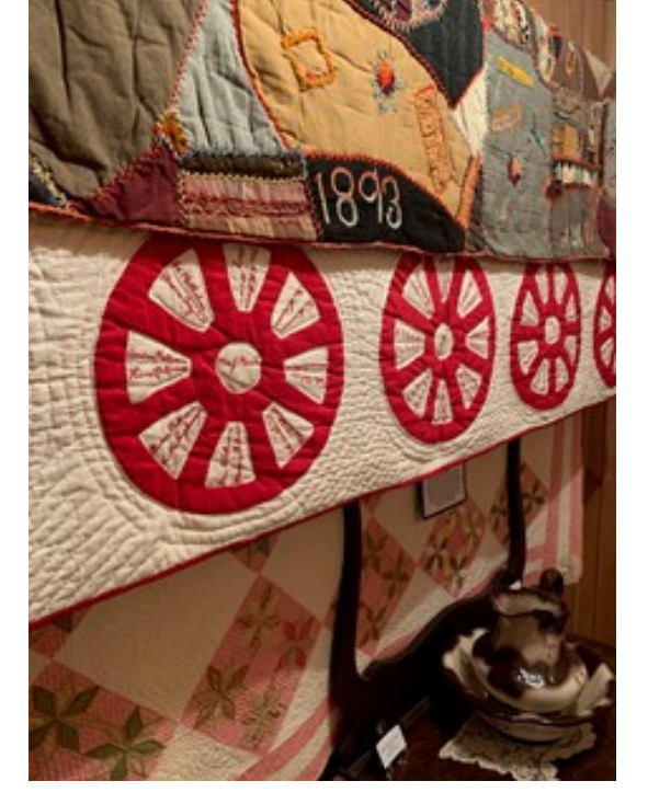
Earnest Worker Quilt, ca. 1900